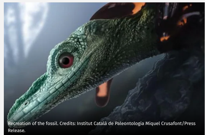
Recreation of the fossil.

After the palaeontologists performed CT scans and analysed the data, they found that the mystery animal had scales -- teeth directly attached to the jawbone, unlike dinosaurs whose teeth are connected to a socket.