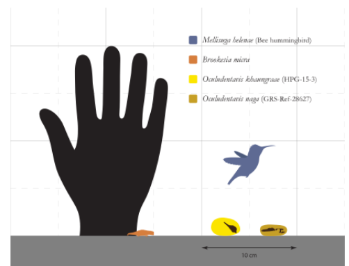
Size of both specimens compared with human hand, bee hummingbird and Brookesia micra

Oculudentavis had a collection of plesiomorphic ("primitive") and advanced traits compared with Mesozoic avialans . For example, it retains separate frontal , parietal , postorbital , and squamosal bones, which are fused together or lost in modern birds. The extensive tooth row is also similar to non-avialan theropods. On the other hand, it lacks a separate antorbital fenestra and the bones of the snout are elongated and fused. These features are more common among modern birds. Some traits, such as the acrodont or pleurodont tooth implantation and spoon-shaped sclerotic bones are unprecedented for dinosaurs as a whole, and instead, are common among modern lizards . [2] A patch of seemingly scaly skin occurs near the base of the skull, unusual for a bird, but consistent with a lepidosaur identity. The high tooth count and apparent lack of an antorbital fenestra or quadratojugal bone have also been used to argue against an avialan identity. [7] The two specimens are distinguished by numerous characters of the skull, though the authors of the description of O. naga noted that it was "possible that at least some of these differences between the two specimens are due to a combination of individual variation, taphonomical deformation , and perhaps sexual dimorphism". [1]