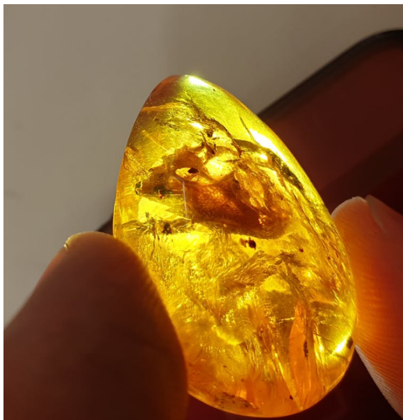
The Yaksha perettii specimen is preserved in amber. The fossil was studied without being removed.

Albanerpetontids, or “albies” for short, are the cute little salamander-like amphibians you’ve likely never heard of.